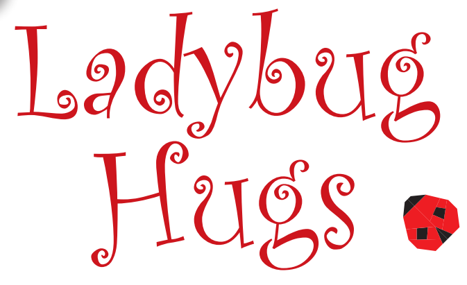
Wrapped up in love